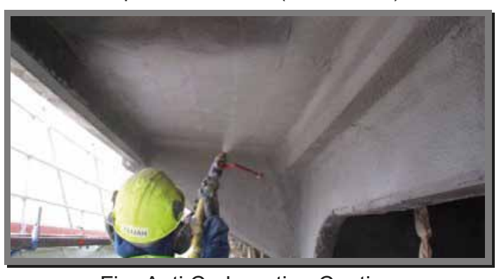
Fig- Anti Carbonation Coating