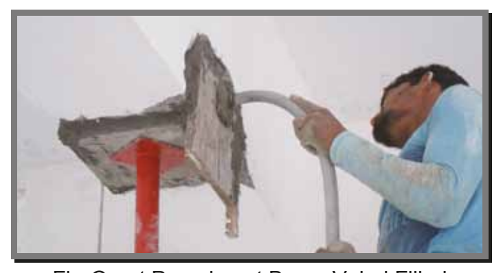
Fig-Grout Pumping at Beam Voied Filled