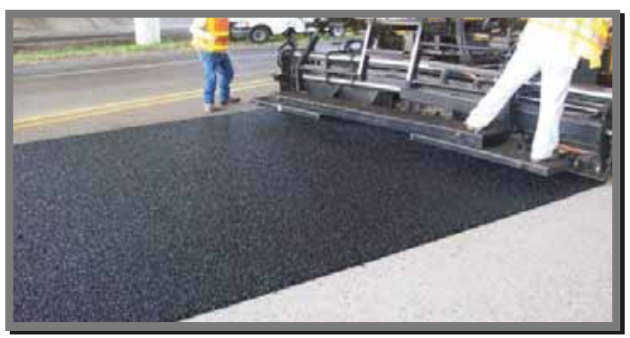
Fig- ShaliSeal RS TC Road Emulsion (Top Coat Road Slurry for Enhancing Road Life by Preventing Water Ingress