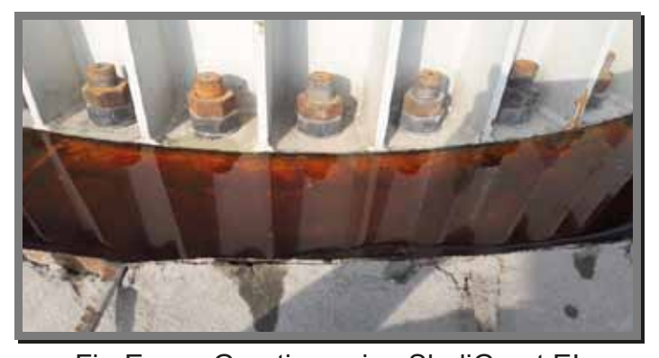
Fig-Epoxy Grouting using ShaliGrout EI