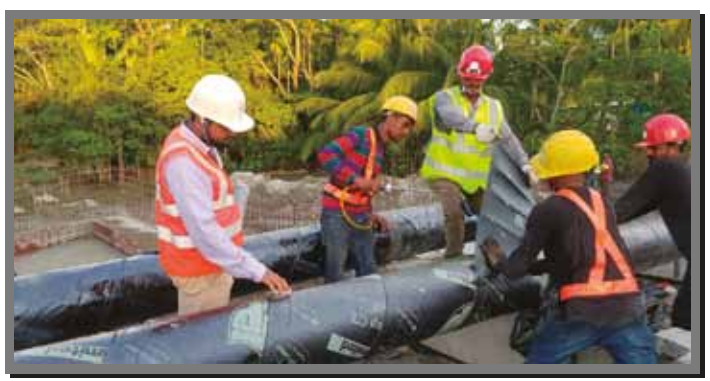
Fig- PipeWrap CT Wraping at 220 MW Bhola