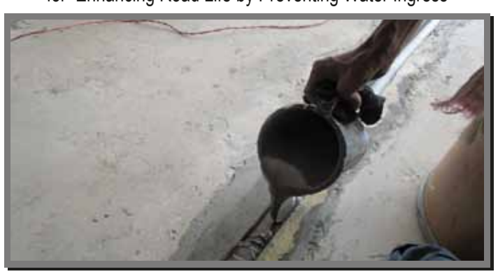
Fig- Joint Sealant for Expansion Joint