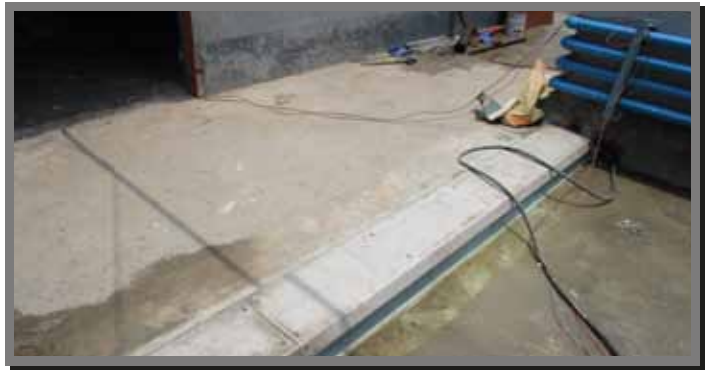
Fig-Aluminium Angle for Expansion Joint