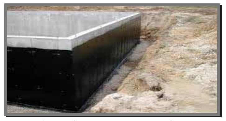
Fig- Single Coat Bituminous Anti-Crrosive Coating