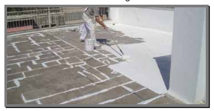
Fig- Waterproofing by PU Liquied Membrane Without Removal Tiles