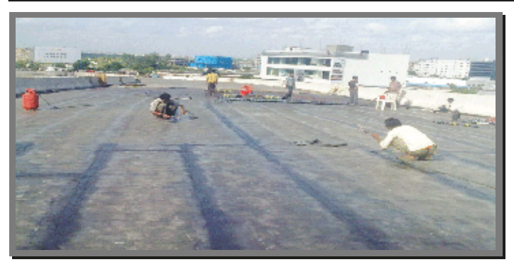
Fig- App Modified Waterproofing Mebrane using SuperThermolay