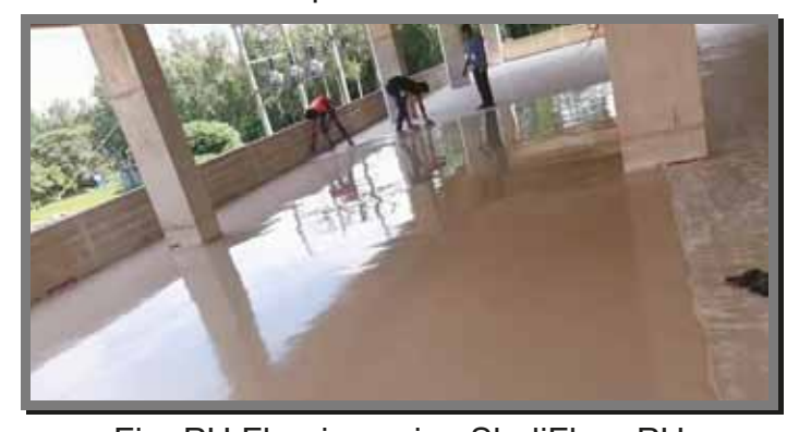
Fig- PU Flooring using ShaliFloor PU