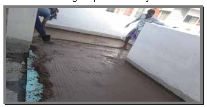
Fig- Thermal Insulation Board With CC Casting