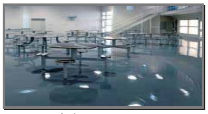
Fig- Self Levelling Epoxy Floor