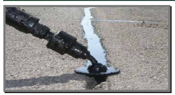
Fig- Bitumen Based Sealing Comound