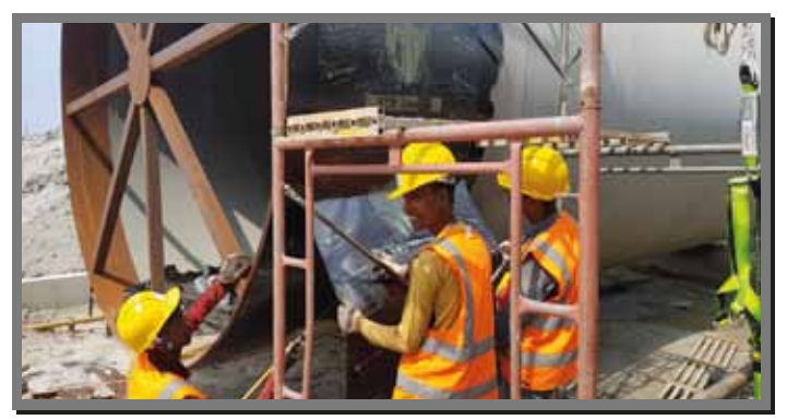
Fig- PipeWraping 1st Layer at 1320 MW Rampal Power Plant