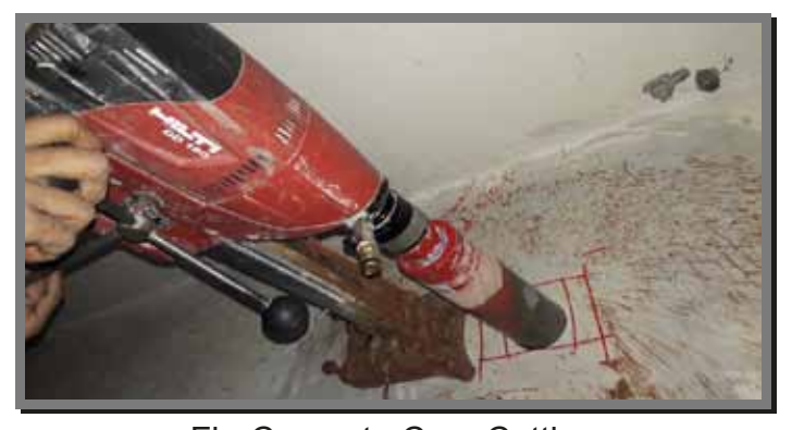
Fig-Concrete Core Cutting