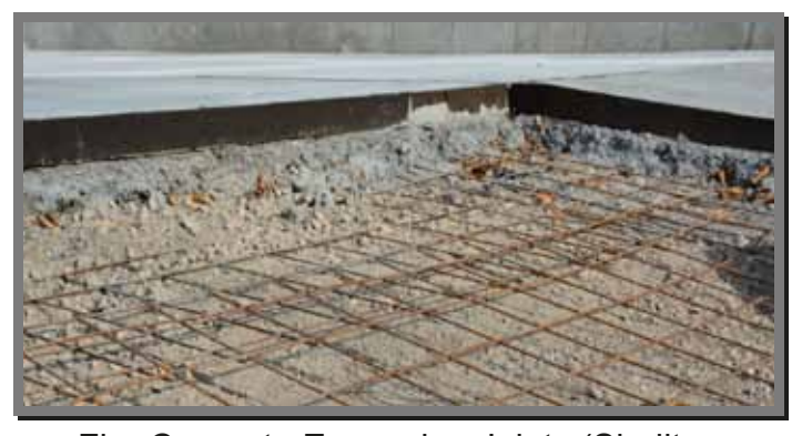
Fig- Concrete Expansion Joints (Shalitex Joint Filler Board)