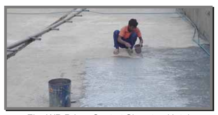
Fig- WP Prime Coat at Sheraton Hotel