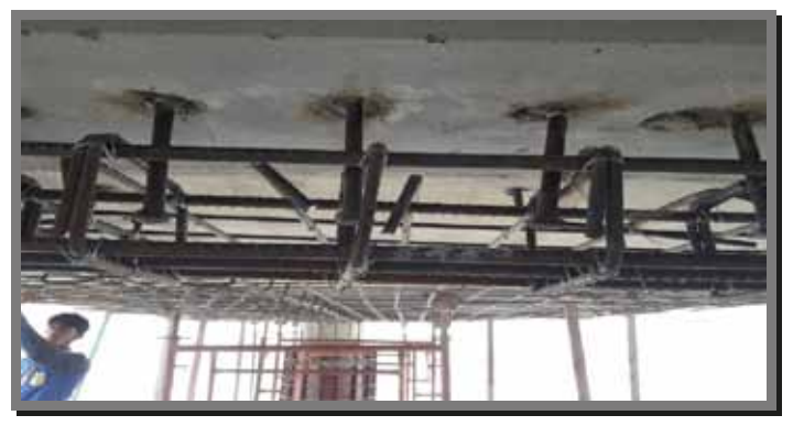
Fig- Bottom Slab Jacketing