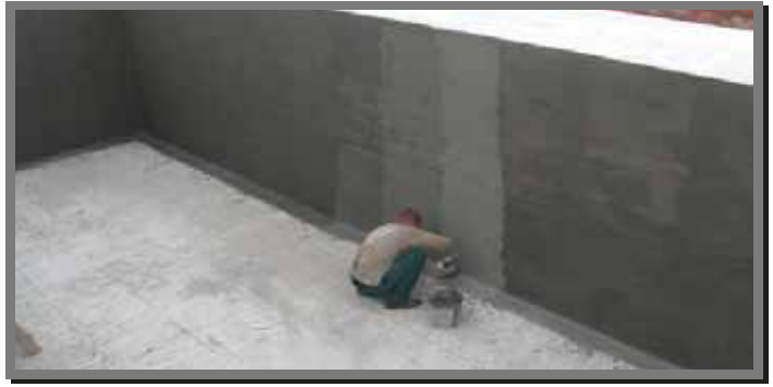
Fig- Cementitious Elastomeric Waterproof Coating