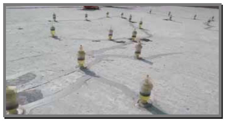
Fig- Crack Fealling by low Viscous Epoxy using ShaliGrout El